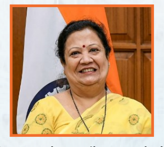
Smt. Darshana Vikram Jardosh Hon'ble Minister of State for Textiles & Railways, Government of India