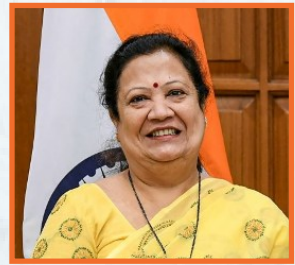
Smt. Darshana Vikram Jardosh Hon'ble Minister for State for Textiles & Railways, Government of India