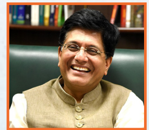
Shri Piyush Goyal Hon'ble Union Minister of Textiles, Commerce & Industry, Consumer Affairs and Food & Public Distribution