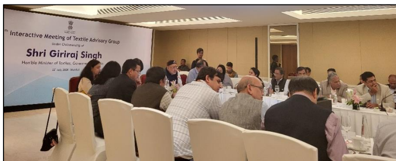
Hon'ble Union Minister of Textiles, Shri Giriraj Singh chairing the TAG meeting

The meeting was also graced by the Maharashtra State Textile Minister, Shri Chandrakant Patil, Secretary (Textiles), Additional Secretary (Textiles), Additional Secretary (Agriculture), Joint Secretary (Fibre), Trade Advisor, Textile Commissioner, and several other Government officials from Ministry of Textiles and Ministry of Agriculture.