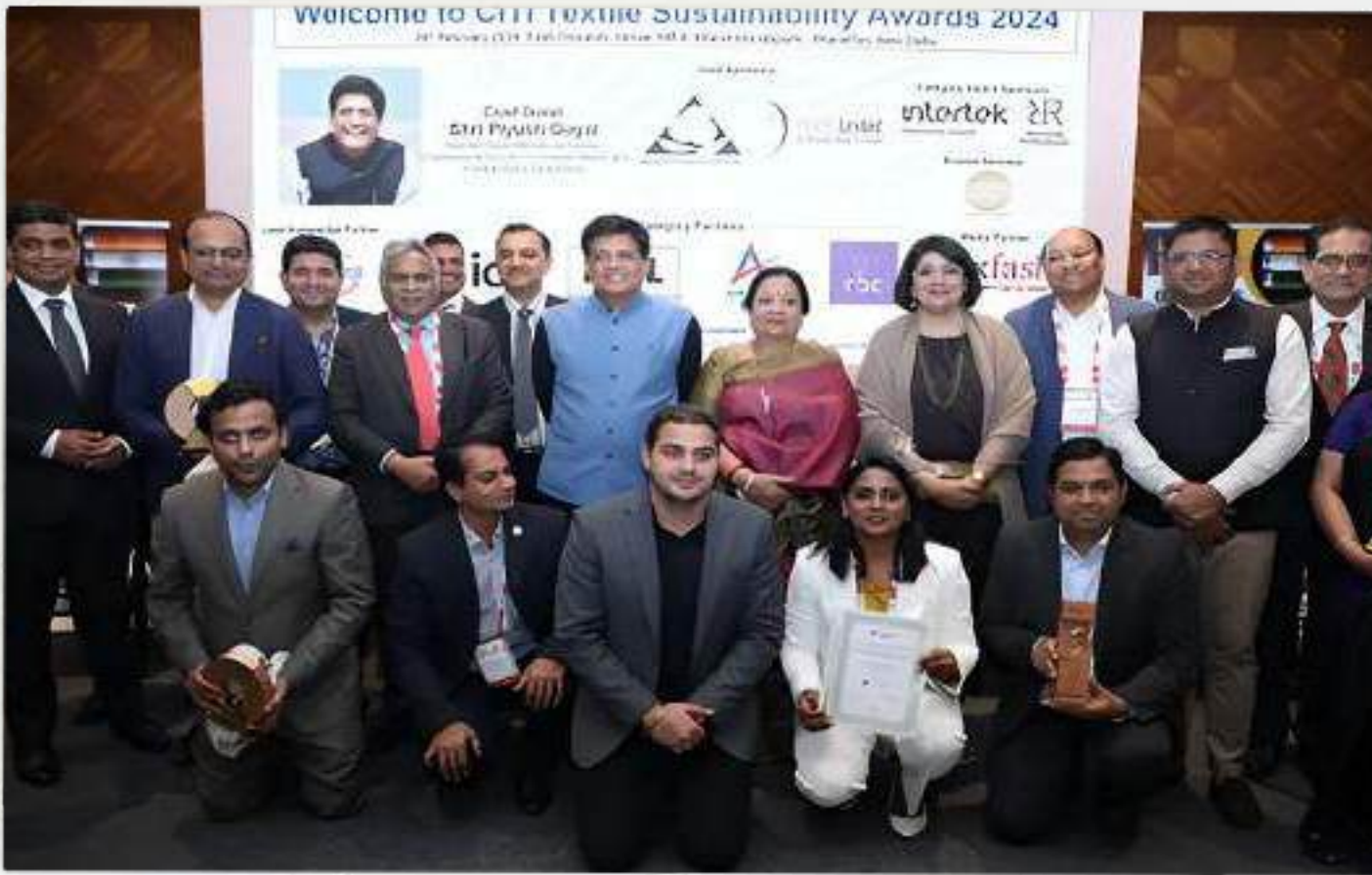
The then Hon'ble Union Minister of Textiles, Shri Piyush Goyal and the then Hon'ble Minister of State for Textiles and Railways, Smt Darshana Jardosh with the winners of the CITI Textile Sustainability Awards 2023-24.