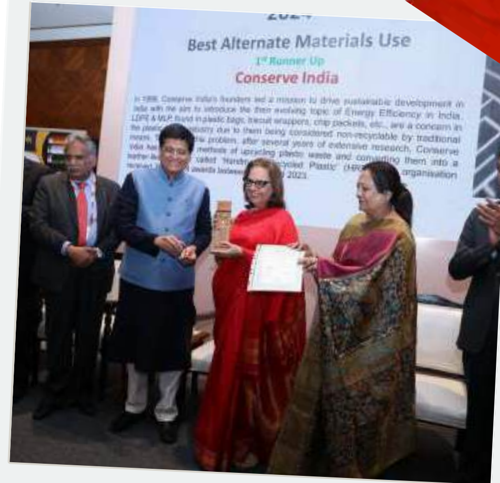
The then Hon'ble Union Minister of Textiles, Shri Piyush Goyal and the then Hon'ble Minister of State for Textiles and Railways, Smt Darshana Jardosh with 1st Runner UP.