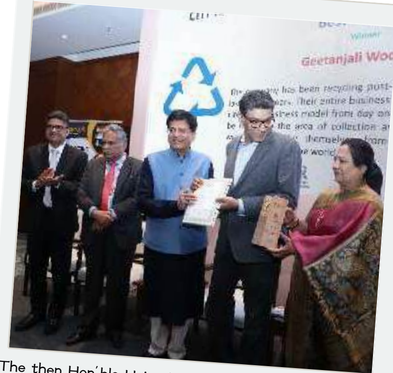
The then Hon'ble Union Minister of Textiles, Shri Piyush Goyal and the then Hon'ble Minister of State for Textiles and Railways, Smt Darshana Jardosh with Mr. Deepak Goel Director, Geetanjali Woollens