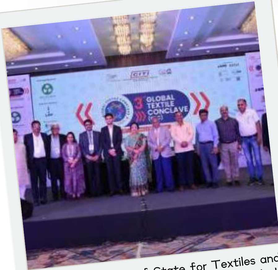
The then Minister of State for Textiles and Railways, Smt Darshana Vikram Jardosh with the Jury of CITI Award 2022-23